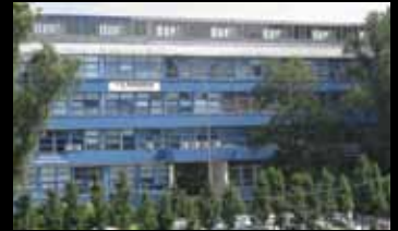
Holmatro Poland Warsaw, Poland Sales & service