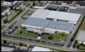
Holmatro Netherlands Rescue equipment Raamsdonksveer, The Netherlands T +31 (0)162 58 92 00 E rescue@holmatro.com Manufacturing, sales & service