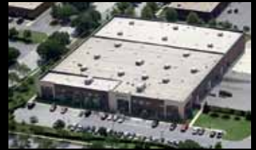
Holmatro USA Glen Burnie, MD, U.S.A. Manufacturing, sales & service