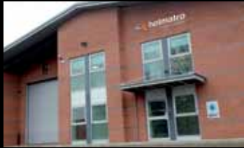
Holmatro UK Nottingham, UK Sales & service