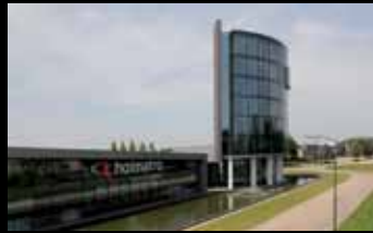
Holmatro Group World Headquarters Raamsdonksveer, The Netherlands