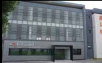
Holmatro China Suzhou, Jiangsu Province, China Sales & service